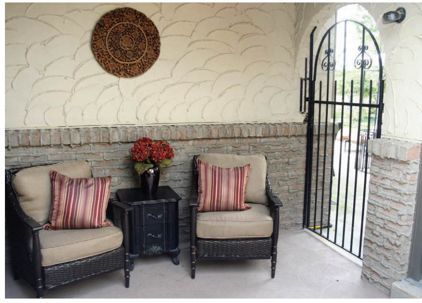
Above: To enter the house, visitors pass through the arch's wrought iron gates and into the semi-roofed courtyard; the patio furniture's red, cream and brown toss cushions punch up the soft taupe brick and stucco walls; an Indonesian side table and carved wood medallion are at home in the Spanish-style house.