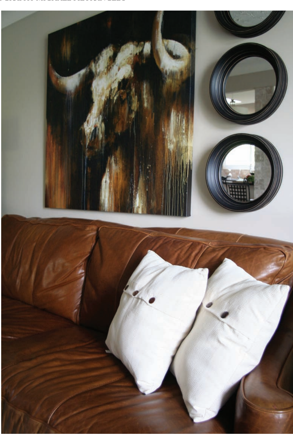
Opposite page: A 1970s house in Tecumseh has been progressively remodelled since the current owner bought it in 2005. The walls of the old L configuration were removed to open the kitchen to the dining and living room areas. The support pillar is covered in travertine tile. The décor's casual chic is emphasized by the distressed wood coffee table and other rustic pieces. Left: The patio door leading off the master bedroom is given contemporary Asian flare with a four panel track window treatment that slides sideways to reveal the parkland view. Above: The living room lives up to its name with a soft as butter, caramel coloured leather sofa to lounge on.